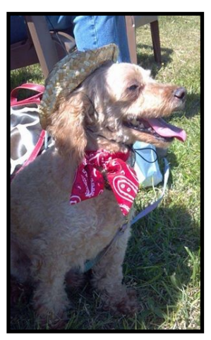
Fabulous Fido winner Fozzy FitzRoy Grant