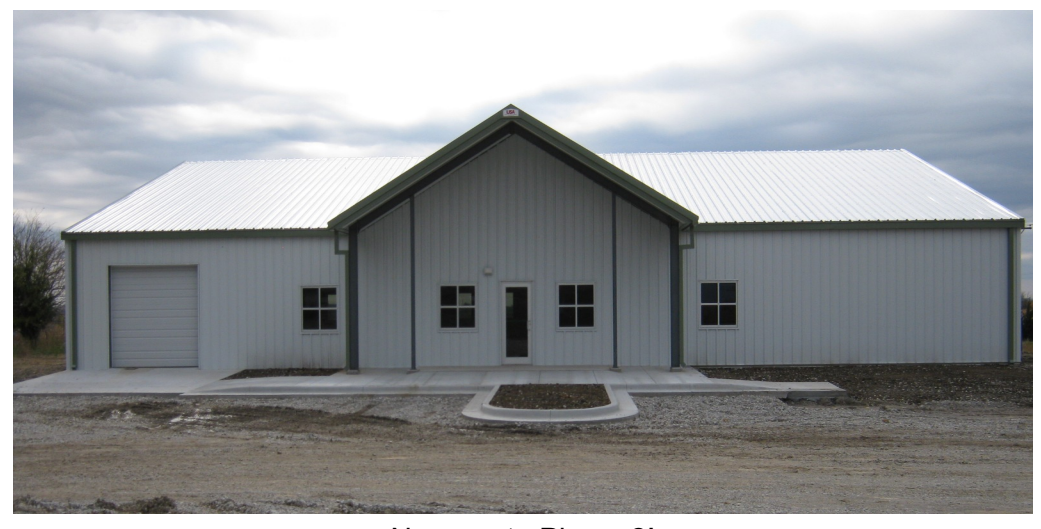
Now, on to Phase 2!