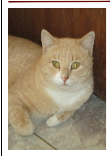
Murray – Adoption pending

Murray and J.P. are both very mellow and total lap cats. They are both neutered and 3 years old. Murray is a big boy at 14# and J.P. isn't far behind. Murray was turned outside when his family got a new Pit Bull puppy. J.P. has been living Johnstone Park for about a year and he likes dogs. J.P. has gone to Sand Springs to join Logan, another ARF cat.