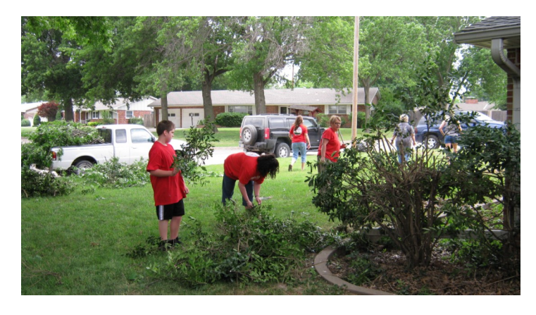
Lots of landscaping!

Lunch was provided by Armstrong Bank. YUM!