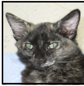
Wilbur, Delta and Piper were our newest residents. They all have new homes for the holidays!

HSUS NATIONAL ANIMAL FIGHTING TIP LINE 877-TIP-HSUS