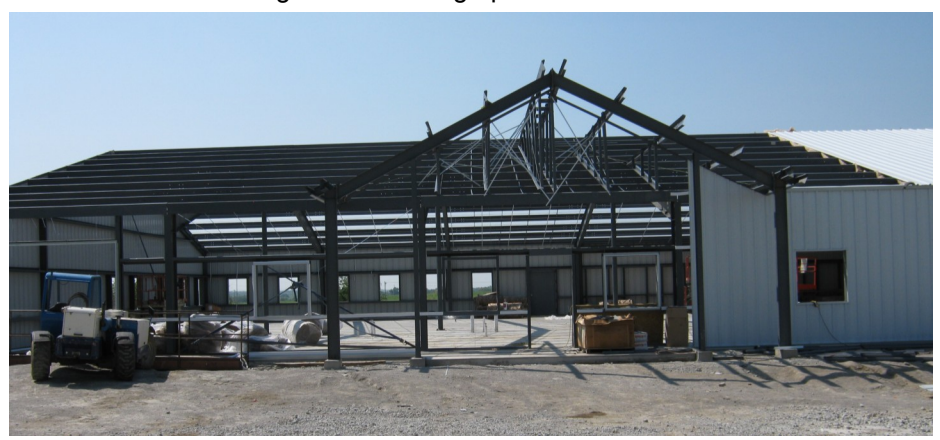
August 15: Working on the sides and front