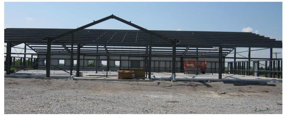
August 18: Putting up the back