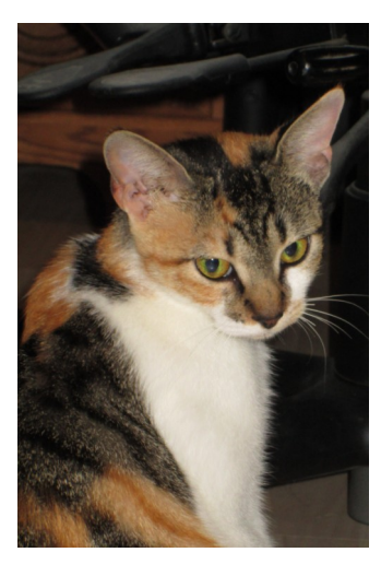
Trinity, mother to Tux, Trinket & Tiara