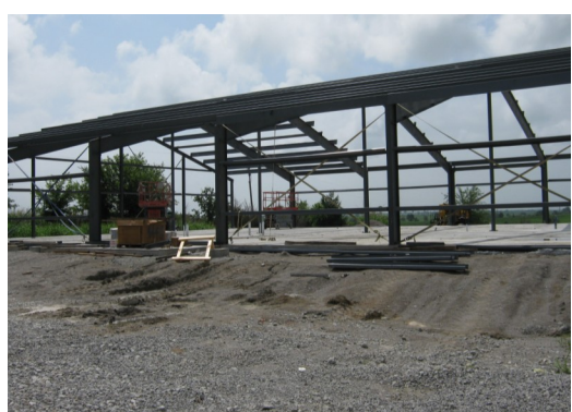
August 11: Frame